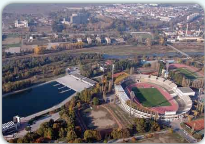
Plovdiv's major sports complex