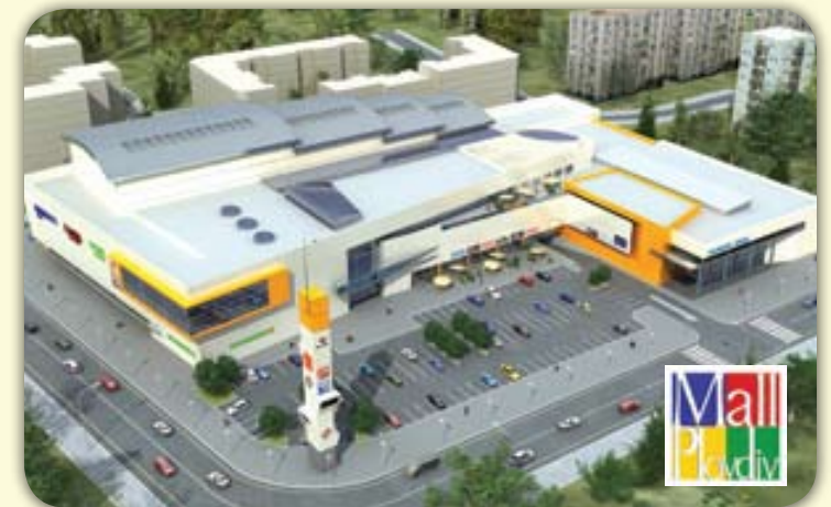
Mall of Plovdiv