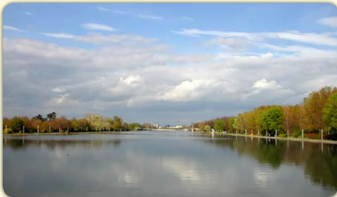
City Park - 7 minutes drive

Plovdiv has many historical attractions such as the Roman stadium, Filipopolis forum and statue perched on the three hills from where you can see the most spectacular views of the city, together with the walls of the fortress Filipopolis, the unique roman theatre and the majestic Sahat Tepe with its clock tower.