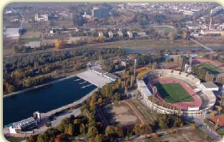
Plovdivs Sports center