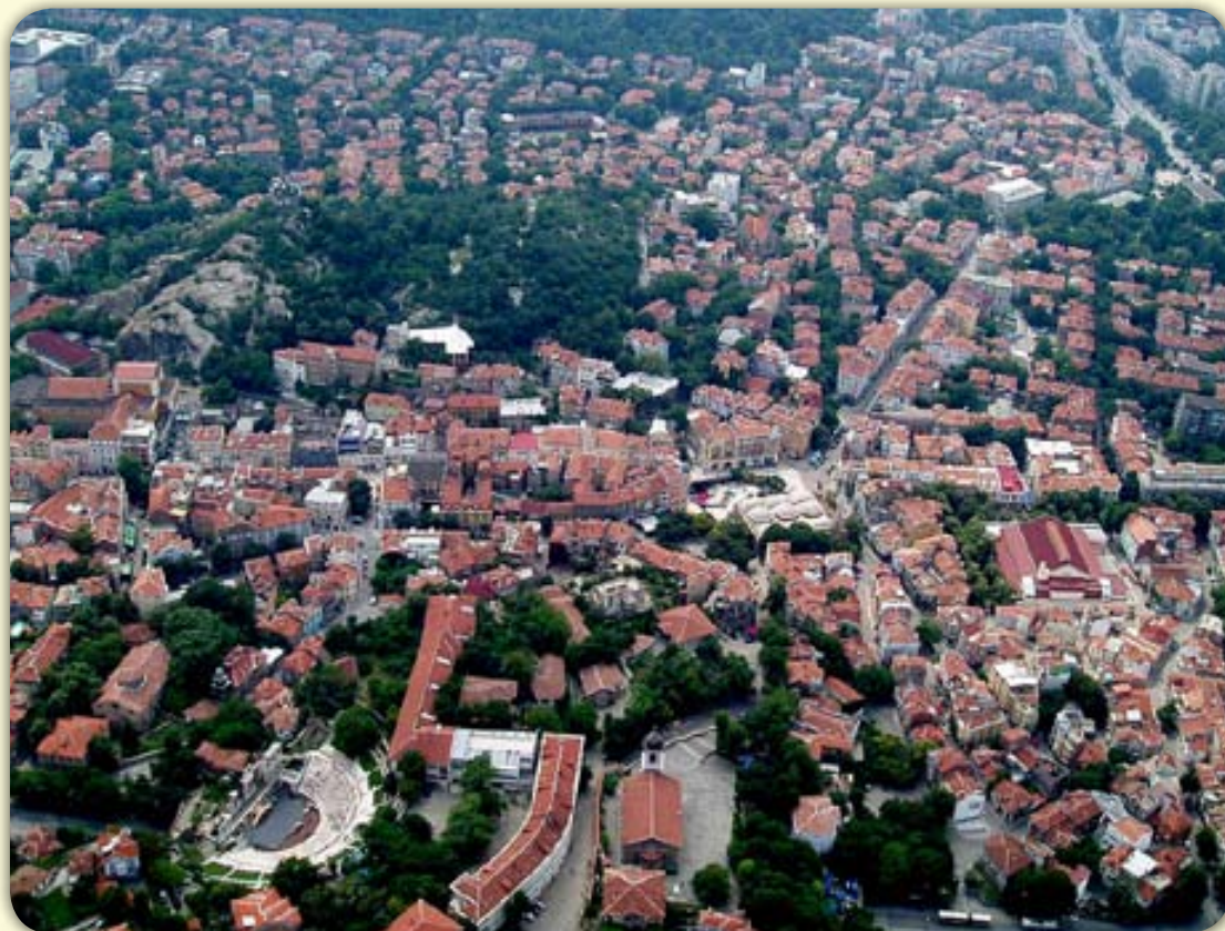
Plovdiv old city

Plovdiv is located in the Thracian plain in southern Bulgaria some 130 kilometers from Sofia, the capital. The city was built on seven hills along the two banks of the Maritza River. Plovdiv is situated in an important, strategic location. Major international routes pass through the city and drive its commerce and growth.