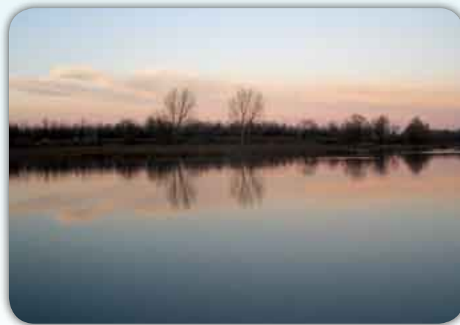
Krichim national park