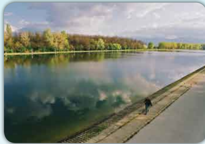
Plovdiv city park