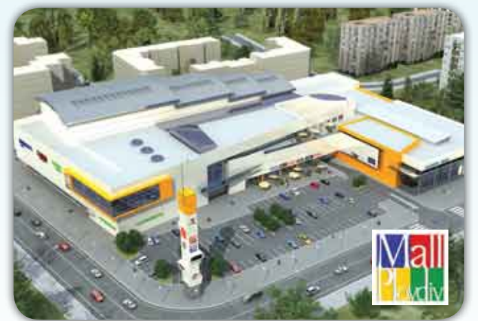
Mall of Plovdiv